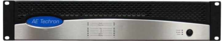
DV1.0 PWM Industrial Amplifier

The DV1.0 is our first PWM amplifier. It is also the first amplifier of its type to have the slew rate and noise floor needed to be called an AE Techron Precision Industrial Amplifier.