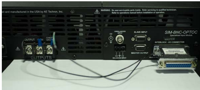
Figure 1 - GCL installed on 7224 amplifier